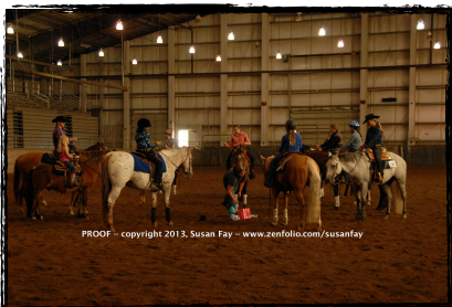
Youth Fun Activities