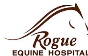
Rogue Equine Hospital