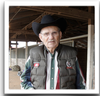
B.F. Yeates, Photo Courtesy of Becca Salamone

This overall positive scoring and awards system provides encouragement to beginning riders and to riders whose horses are just