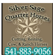
Silver Sage Quarter Horses