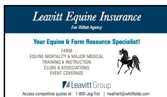
Leavitt Equine Insurance