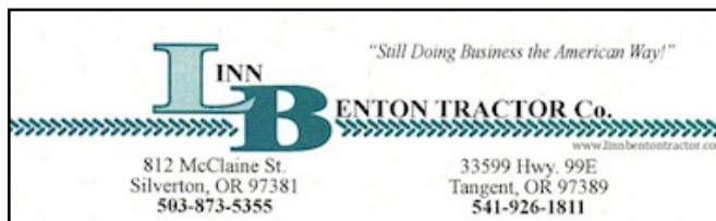
Linn Benton Tractor Co.